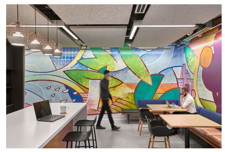
artwork—27 droll food-puns including Peking Duck, Chocolate Moose, and Butter Scotch—created by IA designers. Inspiring quotes wrap portal walls at the open office area and a wall for staff culture encourages interaction in the hospitality zone.

A seamless integration of architectural design and experiential graphic design (EGD) communicates the combined cultures. Strong EGD elements throughout include a brand wall of wood at reception representing S2G's portfolio and designed to reflect its expansion; a 25-foot-long commissioned mural at the café by artist Rob Funderburk; a custom glass film graphic in a pattern inspired by wheat, water, and insects; and a gallery wall of